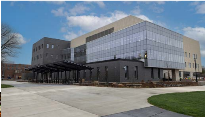
Gale and Paul Kirby Library and Student Resource Center