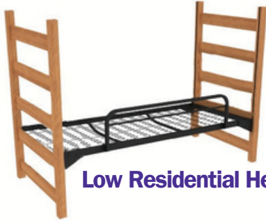
Low Residential Height