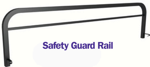
Safety Guard Rail