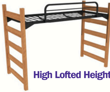
High Lofted Height