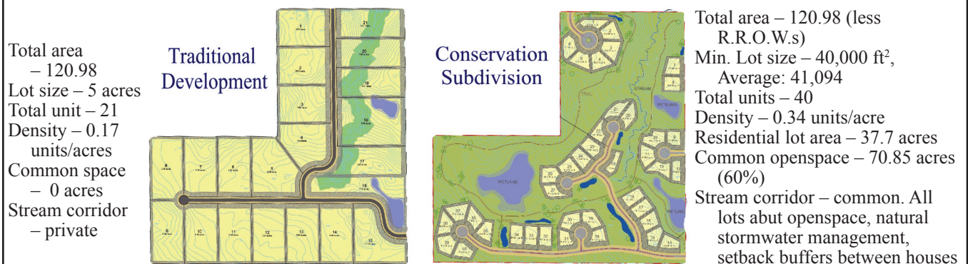
Figure 1: Meadowview Subdivision, Town of Linn, Walworth Co. Private well and septic. Total area 120.98 acres.