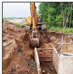
Figure 1: The capital improvement plan is used to identify, prioritize and assign funding to major capital expenditures such as land, buildings, public infrastructure and equipment.