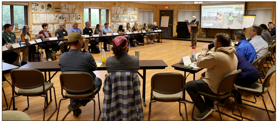
Grant partners gathered for a WFCC Annual Summit in September at Treehaven.

Planning is progressing for the Forestry Advancement Center , a classroom building for the Forest Operations Immersion Training Program at Treehaven. Alliance, a design firm in Minneapolis, has finalized the architectural design. Construction bidding occurred in November, with the bid awarded