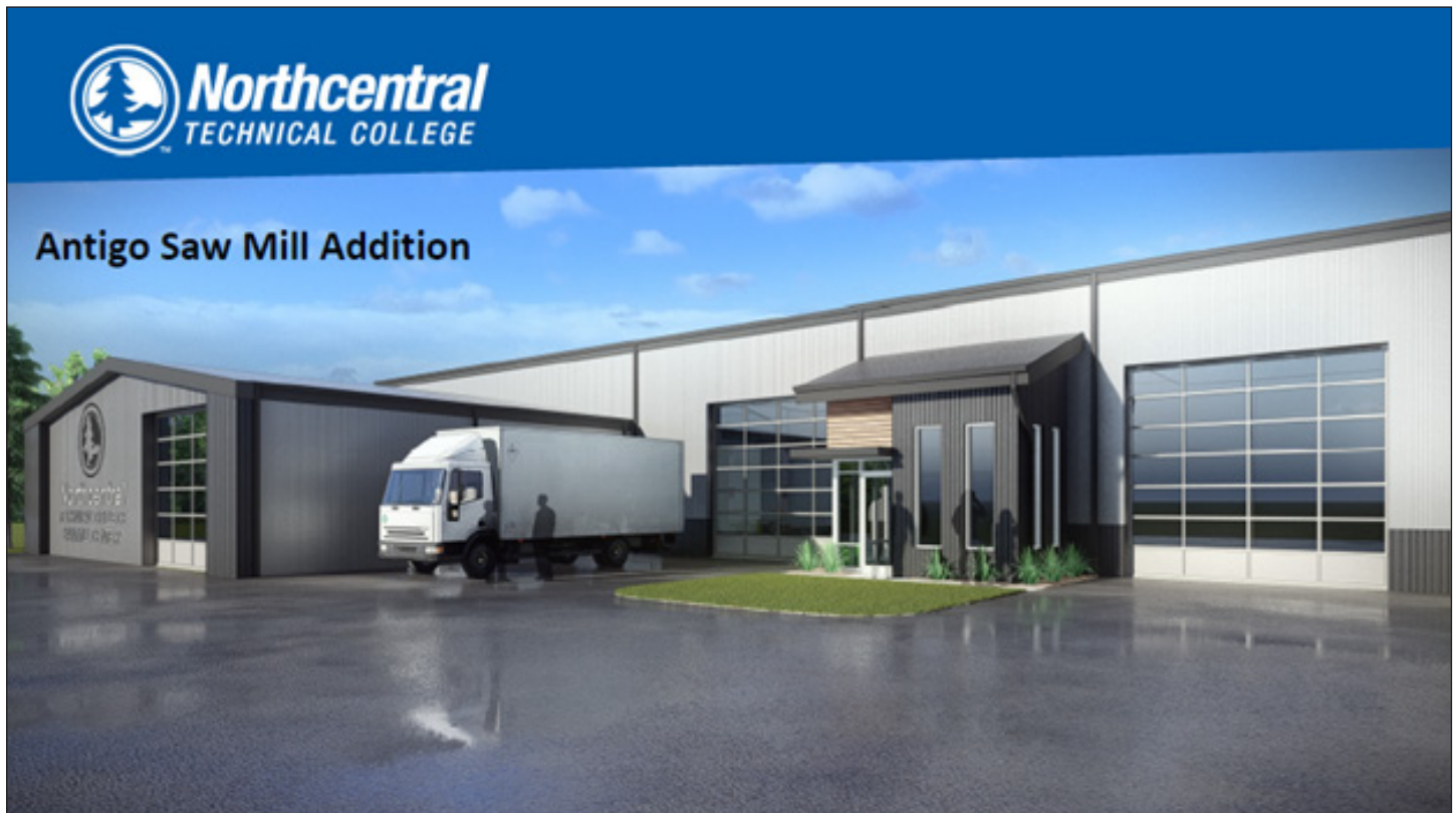
Renderings for the sawmill facility addition at the NTC Wood Technology Center for Excellence in Antigo.