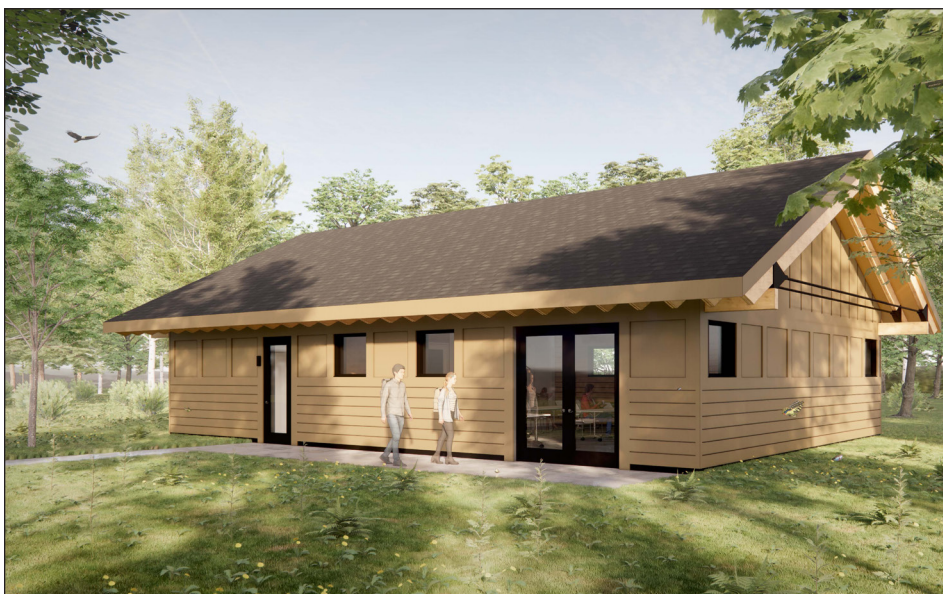
The Forestry Advancement Center (FAC) will be built in 2024 at the Treehaven field station near Tomahawk. The FAC will serve as a dedicated classroom space for the Forest Operations Immersion Training Program.

WFC staff made progress toward developing a marketing strategy . Staff met with Milwaukee Tool in October and the Rodale Institute in November to gain further guidance on marketing the WFCC program.