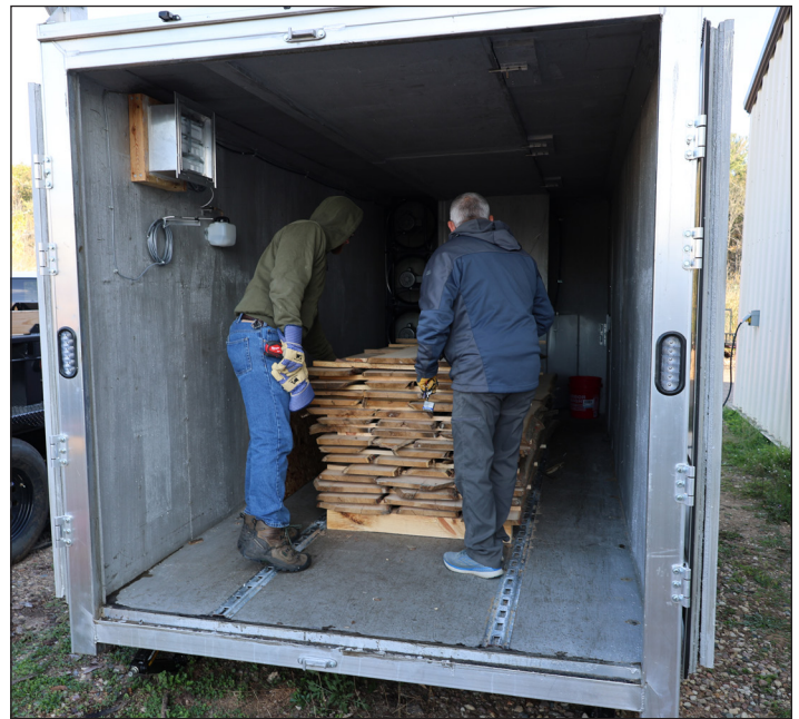
In August 2023 WFC staff, with guidance from Nyle Systems, finished constructing the first of two portable kilns. Built out of modified enclosed trailers and using Nyle Systems controls, the kilns will be used as part of the high school curriculum.

The WFC coordinated a Forestry Workforce Summit in October in Duluth, Minn. It was co-sponsored by the Forest Resources Association and was attended by 10 forestry training program representatives from six states. The goal of the summit was for organizations to provide an overview of their programs and share information related to recruitment strategies, curriculum, and obstacles associated with development and implementation, funding, and program sustainability. The summit has led to the beginning of a new nationwide forestry training network.