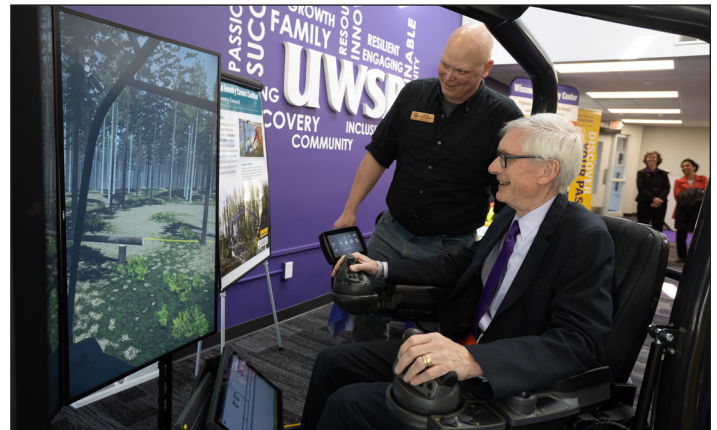
Gov. Tony Evers visited the WFC in March 2023 to learn about the WFCC. He tested out a Ponsse simulator and met with forestry students.

FOREST OPERATIONS TRAINING NETWORK: Organized the first Forest Operations Training National Summit, represented by programs from 6 states. The summit is leading to the creation of a national network of forest operations training providers.