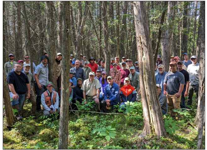
The WFC hosted 47 attendees at a White Cedar Forest Management Workshop in June 2023 in Oconto County.

SILVICAST PODCAST: Released 11 episodes in Season 4, surpassing more than 35,000 downloads worldwide.