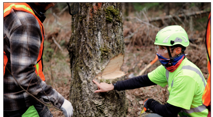
Science of Tree Felling course, March 2021 at Treehaven.

Tree Felling Course: Offered a 3-day Science of Tree Felling course in March 2021 at Treehaven, with 2 high school students participating. Five high-schoolers are enrolled for March 2022 course, with support from the DNR, Milwaukee Tool, and Husqvarna.