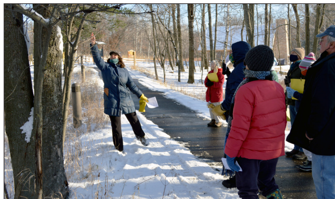
A Winter Tree Identification workshop open to the public in December 2021 at UW-Stevens Point.