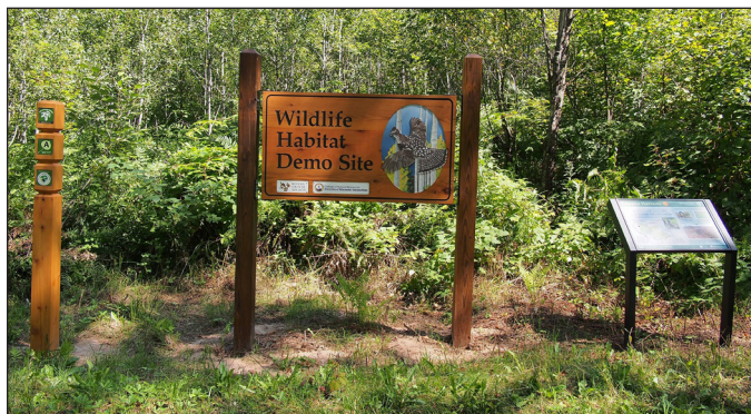
WFC developed a Ruffed Grouse Interpretive Trail at Treehaven.

Women Woodland Owners: Collaborated with the DNR and Aldo Leopold Foundation on Women Woodland Owners: A forester's guide to landowner engagement , as part of the Bringing Sustainable Forestry Outreach into the 21st Century LSR grant.