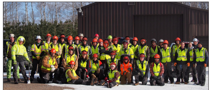
Students and instructors participated in a Science of Tree Felling course in March 2022 at Treehaven.

Milwaukee Tool Endowment: Assisted in facilitating a $1 million Milwaukee Tool equipment endowment to give UWSP College of Natural Resources students access to world-class tools, equipment, and training.