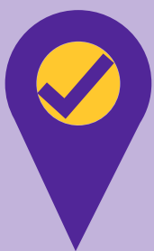
Great Campus Location

Student's name Rm# Neale Hall 433 Isadore Street Stevens Point, WI 54481