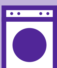
Full Laundry (Free to use!)