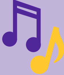
Music Practice Room

Student's name Rm# Knutzen Hall 209 Isadore Street Stevens Point, WI 54481