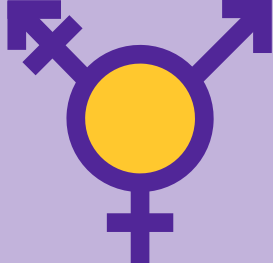
Gender Inclusive Bathroom