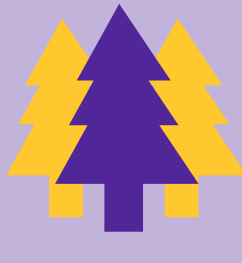
Near Schmeeckle Reserve