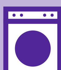
Full Laundry (Free to use!)