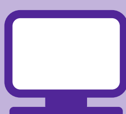
Computer Lab and Study Lounge