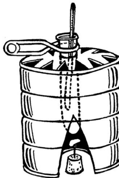
Metal Can Calorimeter