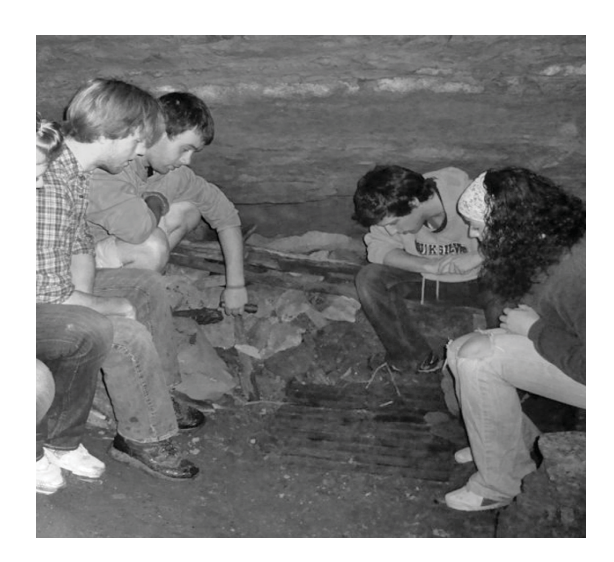
Cast members inspecting hole where Floyd Collins entered Sand Cave