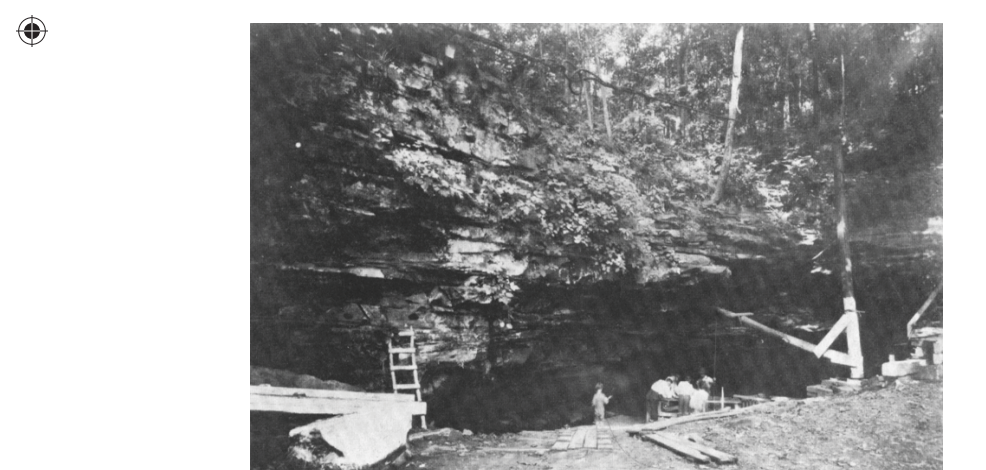
Sand Cave - Summer of 1925