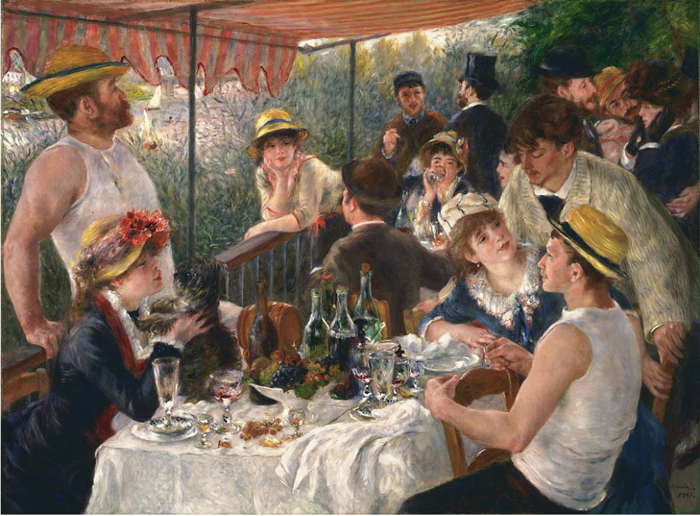
Renoir Luncheon at the Boating Party