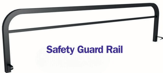
Safety Guard Rail