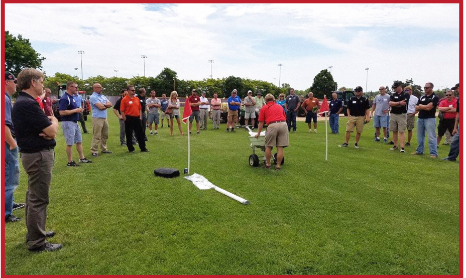
UWSP Facility Services recently hosted the Wisconsin Sports Turf Managers Association, 2016 Summer Field Maintenance Clinic on the UWSP campus and at Stevens Point's City Field.