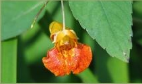
Impatiens capensis (native jewelweed).

Wednesday, April 10, 2024 4:00PM to 4:30PM CDT