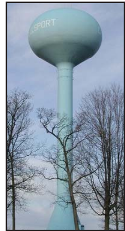
Figure 5: Village of Campbellsport Water Tower

The Village of Campbellsport in Fond du Lac County adopted water and wastewater impact fees in February 2006. The fees are assessed based on water meter size and are due prior to the issuance of building permits. A typical residential meter less than one inch in diameter is charged a fee of $1,850 to cover water and wastewater facilities. Larger meters, associated with more intense development, are assessed between $4,625 (for a one inch meter) and $148,000 (for an eight inch meter). Rates are determined based on standards developed by the Wisconsin Public Service Commission and a needs assessment. Exemptions are available for low-cost housing.