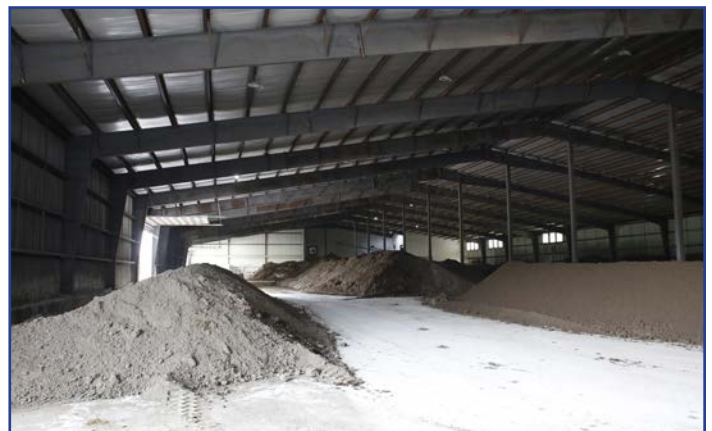
Digestate, digester solids, sold as compost