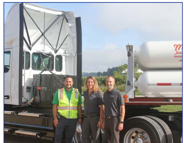
Future electric truck for transporting RNG to injection site