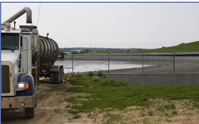
Liquid nutrient loading for delivery to farms

Northern Biogas operates and monitors the three one-million-gallon digesters that produce biogas. The digester liquids go to Step 3 for phosphorus removal and are then returned to the dairy farms. The digester solids are sold to Carbon Cycle, a compost company. Northern also operates and monitors the biogas cleaning equipment that removes contaminants from the RNG.