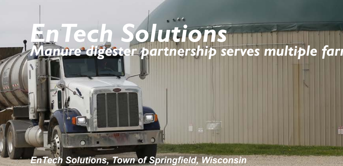
EnTech Solutions, Town of Springfield, Wisconsin

Manure digester partnership serves multiple farms