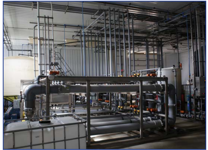
Aqua Innovations reverse osmosis system

Dane County supports phosphorus removal by Aqua Innovations to meet their goal of reducing phosphorus and algae in the Madison chain of lakes. Aqua Innovations uses a reverse osmosis system to concentrate nutrients from the digester liquids. In 2021, over 57,000 pounds of phosphorus were removed and sold to farmers outside the Yahara River watershed. One pound of phosphorus entering a lake or stream can result in up to 500 pounds of algae growth. The digester liquids with reduced phosphorus are trucked back to the dairy farms that provide manure.