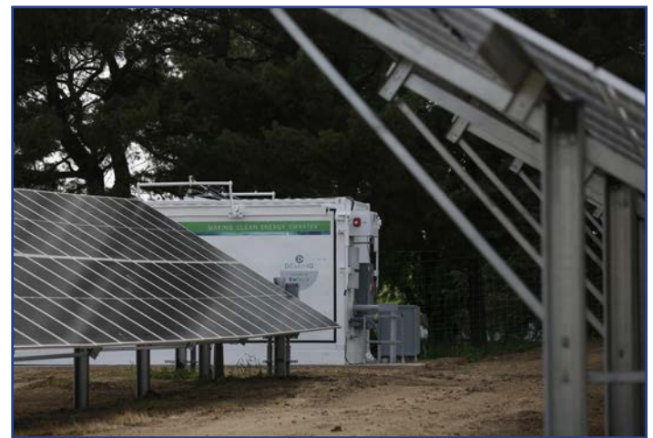
Battery storage with solar arrays

In August 2022, EnTech Solutions announced that they plan to partner with Peterbilt Motors and Maki Trucking to use an electric truck to haul the compressed RNG about 20 miles to a pipeline injection port. This truck will be powered by EnTech’s solar arrays.