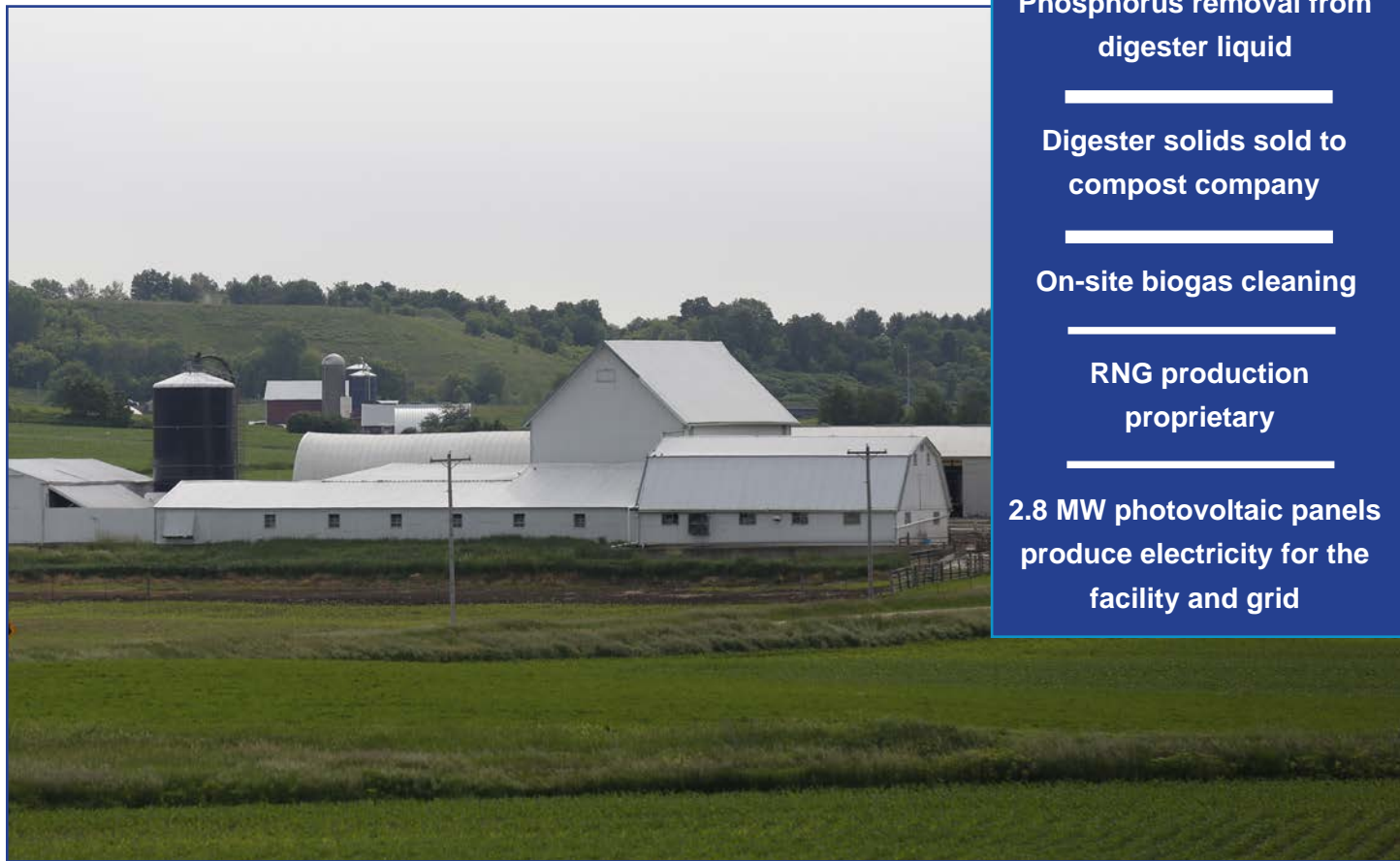
Zeigler Dairy Farms across from EnTech Solutions transports manure via pipeline to the digester

EnTech Solutions, one of the partners, says, "Overall, the facility reduces emissions by more than 13,500 metric tons of carbon dioxide equivalent per year. This reduction is comparable to removing emissions of nearly 34 million miles driven by passenger vehicles."