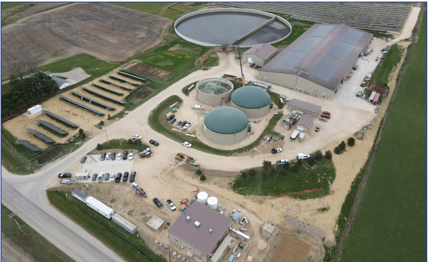
EnTech Solutions Middleton digester facility, Town of Springfield, Wisconsin

In the future EnTech plans to add manure from another dairy farm or two, add a fourth digester, haul the RNG to the injection port with an electric truck, and consider a few different options to increase use of electricity produced onsite.