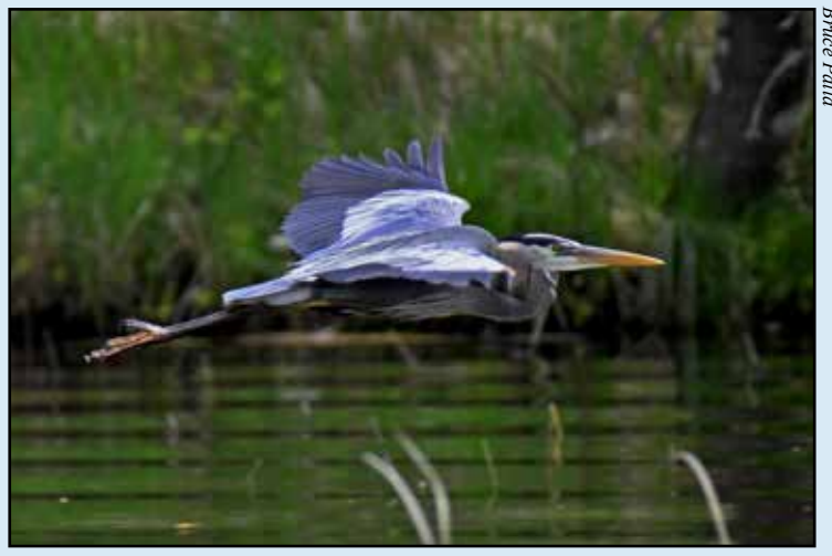
Low Altitude Flight, taken on Upper Eau Claire Lake in Bayfield Wisconsin, took third place in the Natural Features category of the 2020 Wisconsin Lakes and Rivers Photography Contest.

You can find all of the rules, judging criteria, and prize information on our website at <u>uwsp.edu/uwexlakes</u> (just click on the Wisconsin Water Week logo on our main page). There's even a link to winners from previous contests.