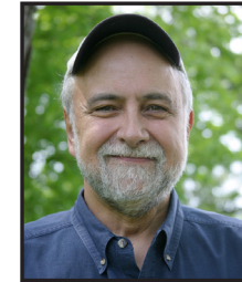
Kim Mello Lake Tomah Monroe County