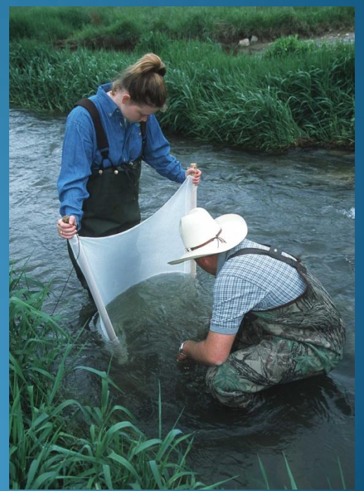
WI Master Naturalist Program