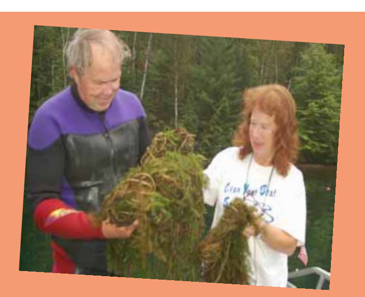
Shoreline Weed Attack Team Created by Sandy Engel