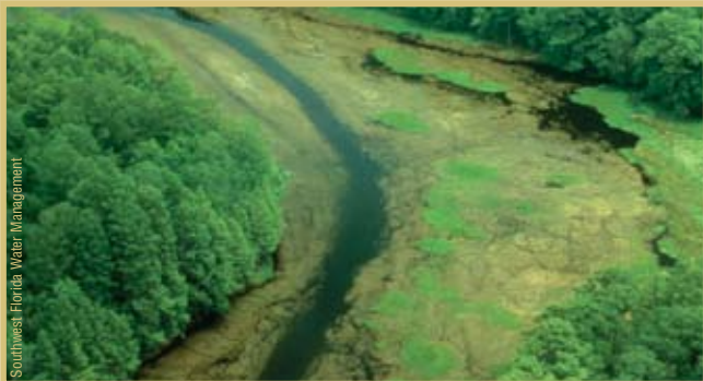
Southwest Florida Water Management