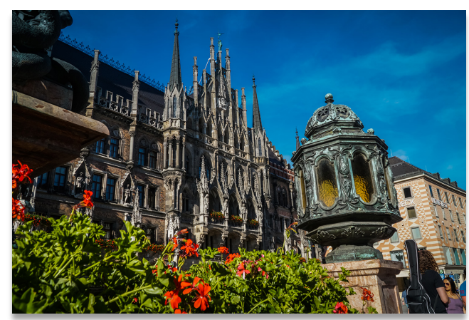
Munich Townhall