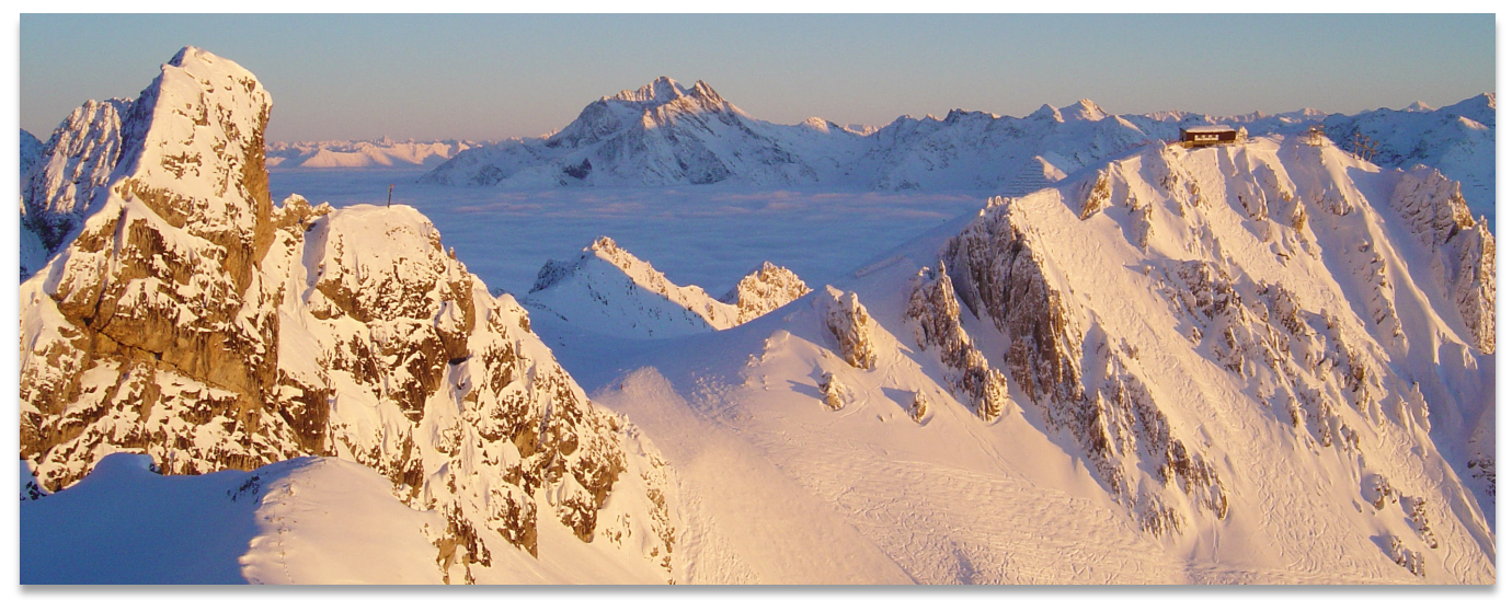
St. Anton