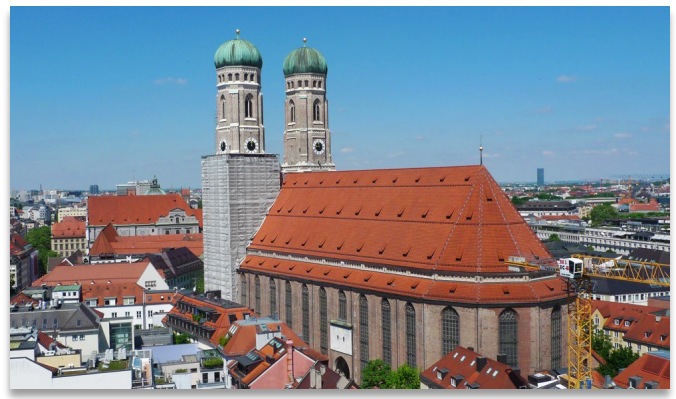
Frauenkirche - Cathedral of Our Lady