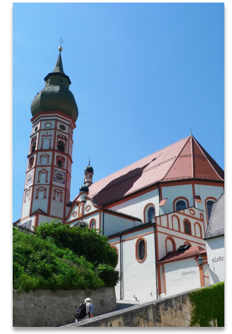
Andechs Monastery

Depending on weather, take the Underground out to Herrsching and enjoy a gorgeous walk through the rolling Bavarian countryside