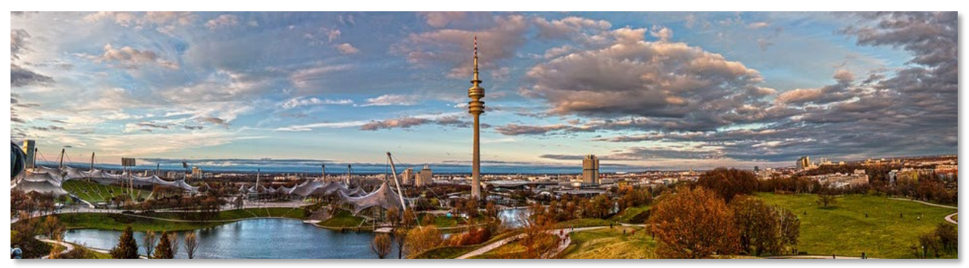
Munich's Olympic Stadium

Motor Coach transfer to Munich. Overnight: Hilton Munich City Meals included: B