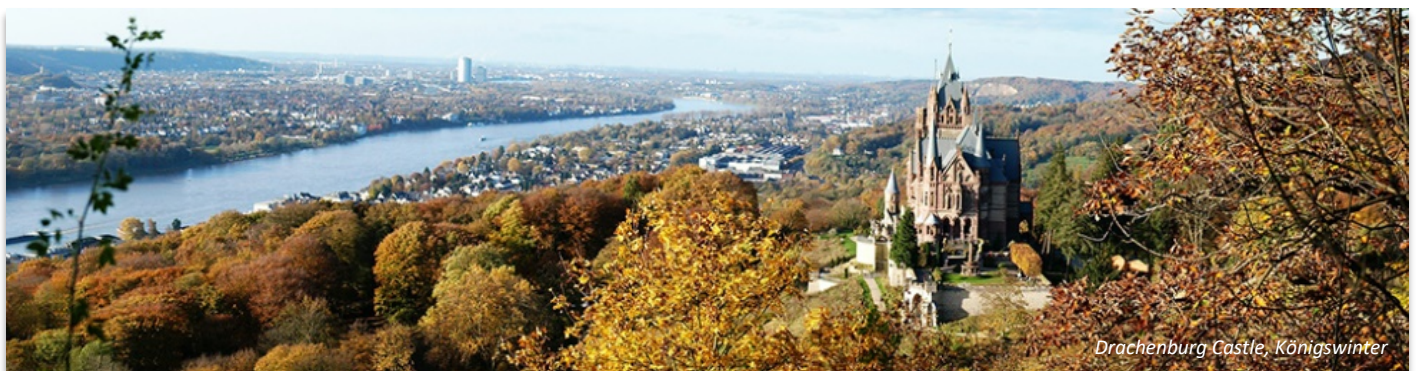
Drachenburg Castle, Königswinter

Castle Drachenburg in Königswinter on the Drachenfels (steep slope) is a 19th century palace-style villa. Also in Königswinter, experience an underwater world at Sea Life. Journey further to Bonn and take in extra excursions to museums like the Bundeskunsthalle and its exhibitions on German art, culture, science, tech, history and the environment; the House of History, one of Germany’s most popular museums; the House of Beethoven; the Bundesviertel; as well as the Rheinaue. Overnight: MS Olympia. Meals included: B, L, D.