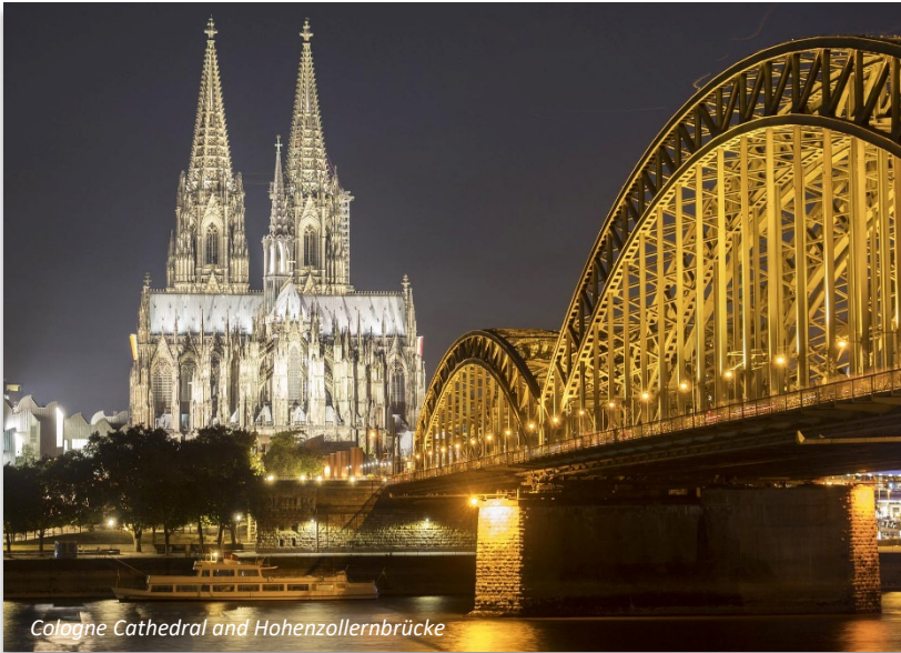
Cologne Cathedral and Hohenzollernbrücke