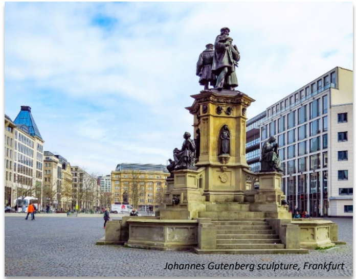
Johannes Gutenberg sculpture, Frankfurt

INCLUDED: The cost includes all lodging (3-4 star, casual, clean, en suite, air conditioned, hotel rooms and on-barge rooms) based on double occupancy, meals listed (Meal Key: B = Breakfast, L = Lunch, D = Dinner), all group land transfers with train, 1-2 tour leaders (depending on group size), 1 WPR tour host, bicycle rental (optional), cycling maps, port fees, Germany's Castles by Bike and Boat traveler handbook and traveler orientation.