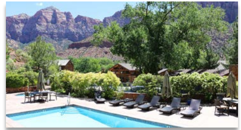
Poolside at Flanigan's Inn

Shuttle to McCarran International Airport (Las Vegas). Meals included: None