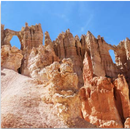
The hoodoos in BC

Now that your legs are seasoned for more activity, hike along the Peekaboo Loop Trail for half the day. Begin at Bryce Point and descend quickly to the canyon floor. You'll enjoy spectacular landscapes but this trail will take a toll on your stamina – it's listed as "strenuous" by the NPS due to the rapid elevation change and length. After a group lunch, enjoy a free afternoon relaxing or hiking on your own or with a buddy. Have fun but don't overdo it, you'll be hiking at least 3 more trails in Zion. Overnight at The Lodge at Bryce Canyon . Meals included: Group Lunch