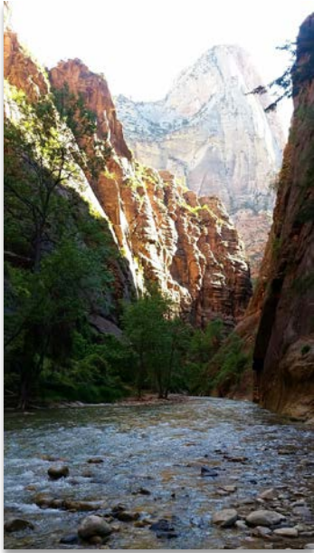
The Narrows in Zion