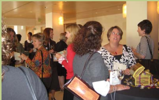
STUDENTS AND PROFESSIONALS OF THE ASID WISCONSIN CHAPTER ON THEIR TREASURE HUNT DURING THE ANNUAL MEETING

If you would like to get involved in ASID, contact your class representative or any ASID officer.