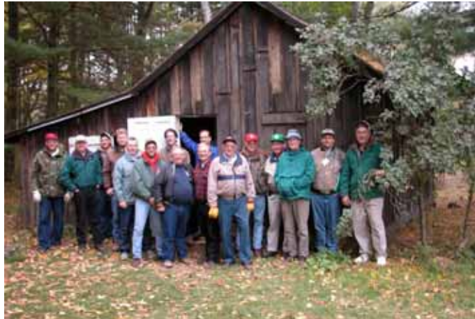
Wisconsin's Woodland Leadership Institute Class of 2002

Sixteen Woodland owners from across the state graduated from this year's Woodland Leadership Institute. The men who made up this year's crew came with varied backgrounds, interests, and experience. However, they all shared a deep concern for Wisconsin's forest lands and their experience with the Institute helped them all to gain new insights and a deeper understanding of the issue that face Wisconsin's forests. They came as strangers but part as friends and colleagues.