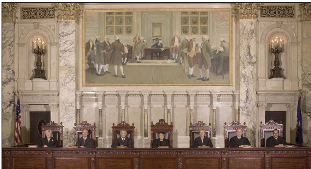
Wisconsin Supreme Court.

Yes, there are multiple levels of appeal possible. In the most common route of appeal, the zoning board decision is first appealed to the circuit court. The circuit court decision can be appealed to the court of appeals, which must either take the case or ask the Wisconsin Supreme Court to take the case directly. 195 If the court of appeals issues a decision, its decision can be appealed to the Wisconsin Supreme Court, which hears only a small fraction of the cases sent to it. 196 For a full range of appeal routes, see the diagram on the Wisconsin Supreme Court webpage. 197