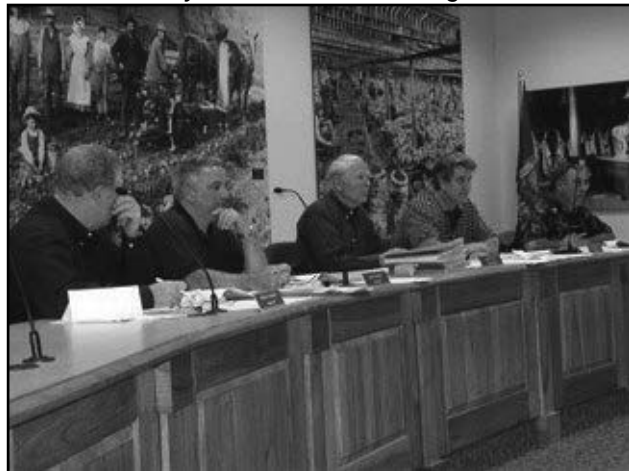
Figure 31: Cedarburg Town Board.

To achieve community planning goals and adhere to legal standards, the zoning board must sometimes make unpopular decisions. The elected officials on the governing body will eventually hear about these decisions, making it important that they understand land use issues and the rationale of the zoning board. Land use planning initiatives, education about zoning and other plan implementation tools, and discussions about current land use topics can help the governing body gain a sense of confidence in the decisions that the board makes.