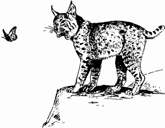
Bobcat or Wildcat

The bobcat, a resident of the forests of Wisconsin, is rarely seen by man. A key reason for this is that like most cats, it is nocturnal. Most of its day is spent resting in well hidden locations. The bobcat is the smallest of the North American "wildcats." It weighs from 15 to 25 pounds and rarely exceeds 40 pounds. The average adult is about three feet long and 15 to 18 inches high. The female is typically about 25% smaller than the male.