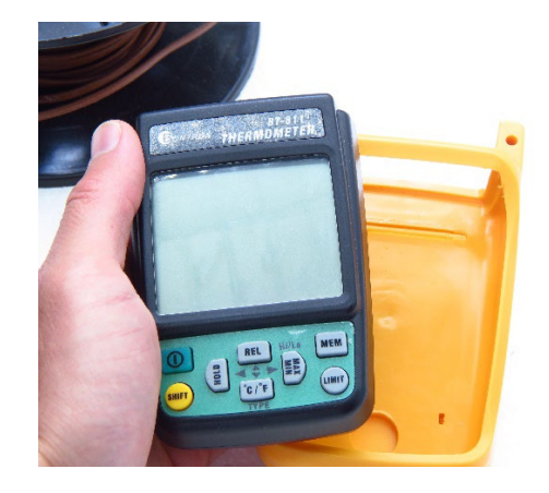
To put the unit back into the case, just press one end in and then the other.

There is a small Phillips-head screw in the back battery cover. Remove the screw and tap the unit to remove the battery cover. The unit takes 4 AAA batteries.